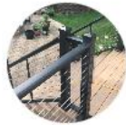
NOVA + Orion Systems